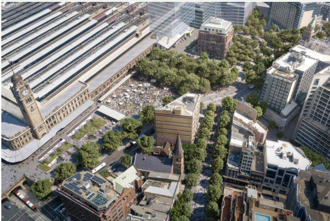
Image: Concept design for central square

Collaboration between universities and industry will maximise the commercial potential of research and development projects. This'll attract talent and investment and in turn accelerate the precinct's productivity.