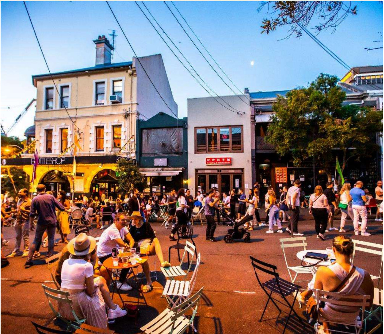
Image: Summer Streets 2022, Stanley Street, Darlinghurst

We will continue this program three times per year, across seven main streets to drive vibrancy and support for our local city centres.