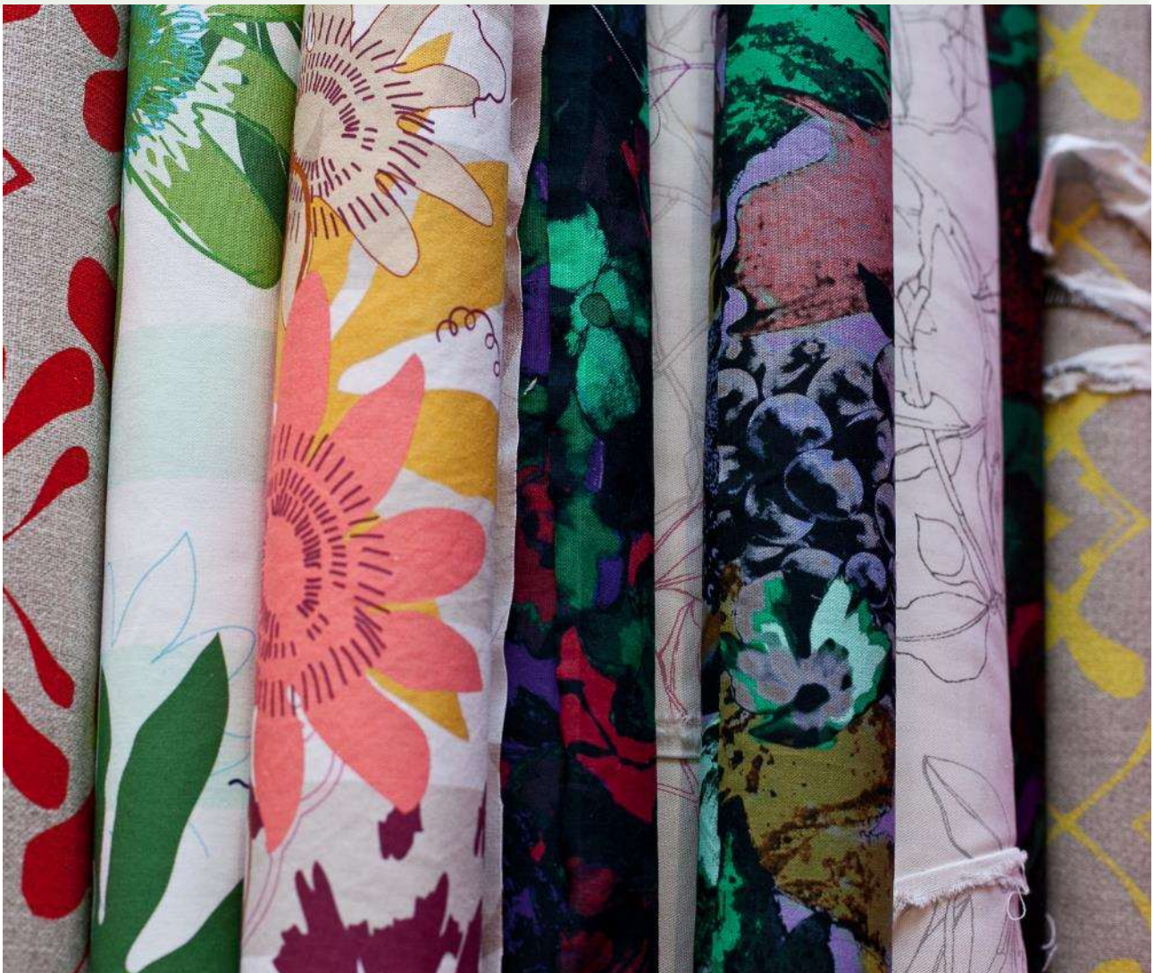
Image: Colourful textiles on display

The project showcased a true example of a circular economy model by turning textile waste into a resource. It demonstrated the commercial value of the circular approach that'll encourage stronger and wider collaborations across industries.