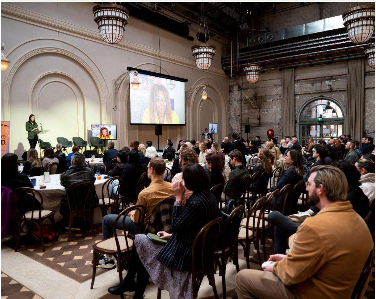
Image: Visiting Entrepreneur Program 2022, The Grounds, South Eveleigh

Partnering with over 90 organisations, including Sydney Startup Hub, StartupAus, Spark Festival, USYD, UNSW, UTS, and Cicada Innovation, it's delivered 74 events for over 6,500 members of the local tech startup ecosystem.