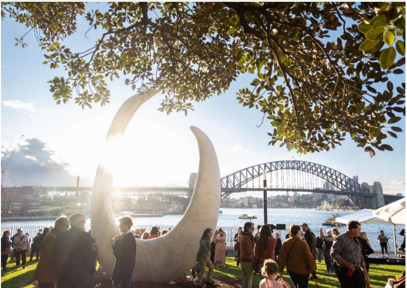
Image: bara by Judy Watson, above Dubbagullee, Royal Botanic Gardens. This public artwork is part of the Eora Journey

Yananurala invites us all to celebrate and learn from our beautiful harbour. It's hoped it will help locals and visitors better understand Country in a way Aboriginal people have experienced for millennia.