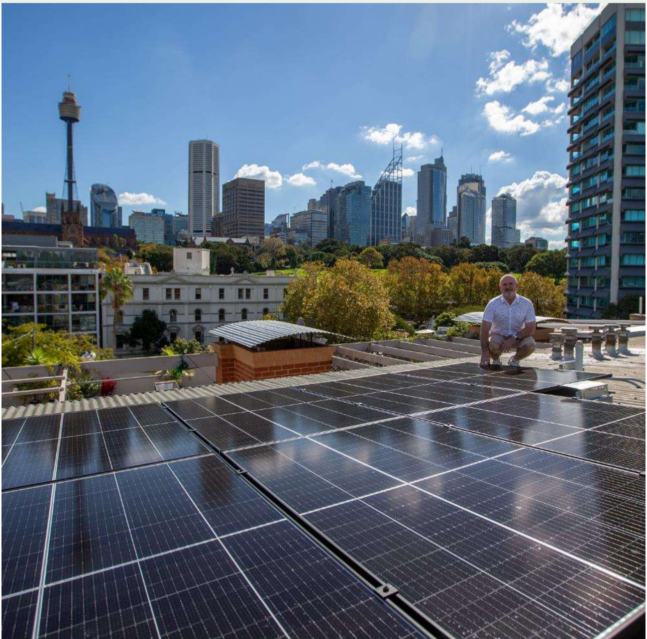
Image: Smart Green Apartments Program, Solar panels at the Galleria 27-51 Palmer Street, Woolloomooloo

To encourage businesses to take the move, we started promoting our own power purchase agreement. We also developed a range of resources to educate businesses about offsite renewable electricity options, including Power Purchase Agreements and GreenPower.