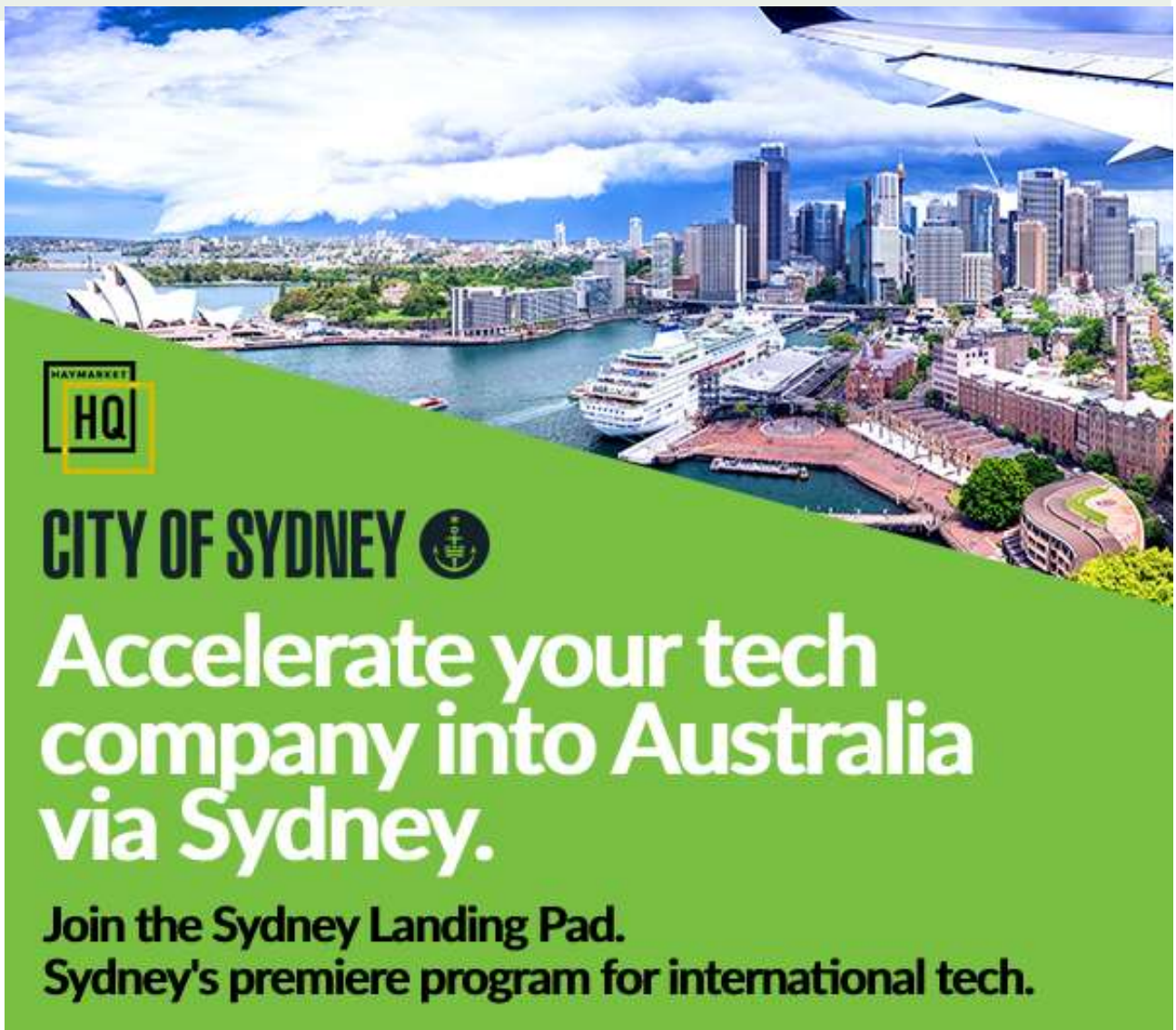
Image: Promotional image for the Sydney Landing Pad

We are now in discussion with industry partners to explore the opportunity to launch the second iteration of the Sydney Landing Pad Program.