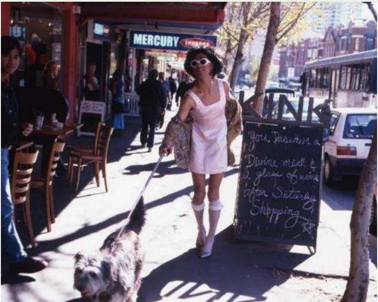
Image: Dog walker on Oxford Street circa 1988

Visibility is vital to create a proud, colourful, and welcoming destination that Oxford Street is known for globally. We will also continue to address disadvantage and connect people with the services they need.