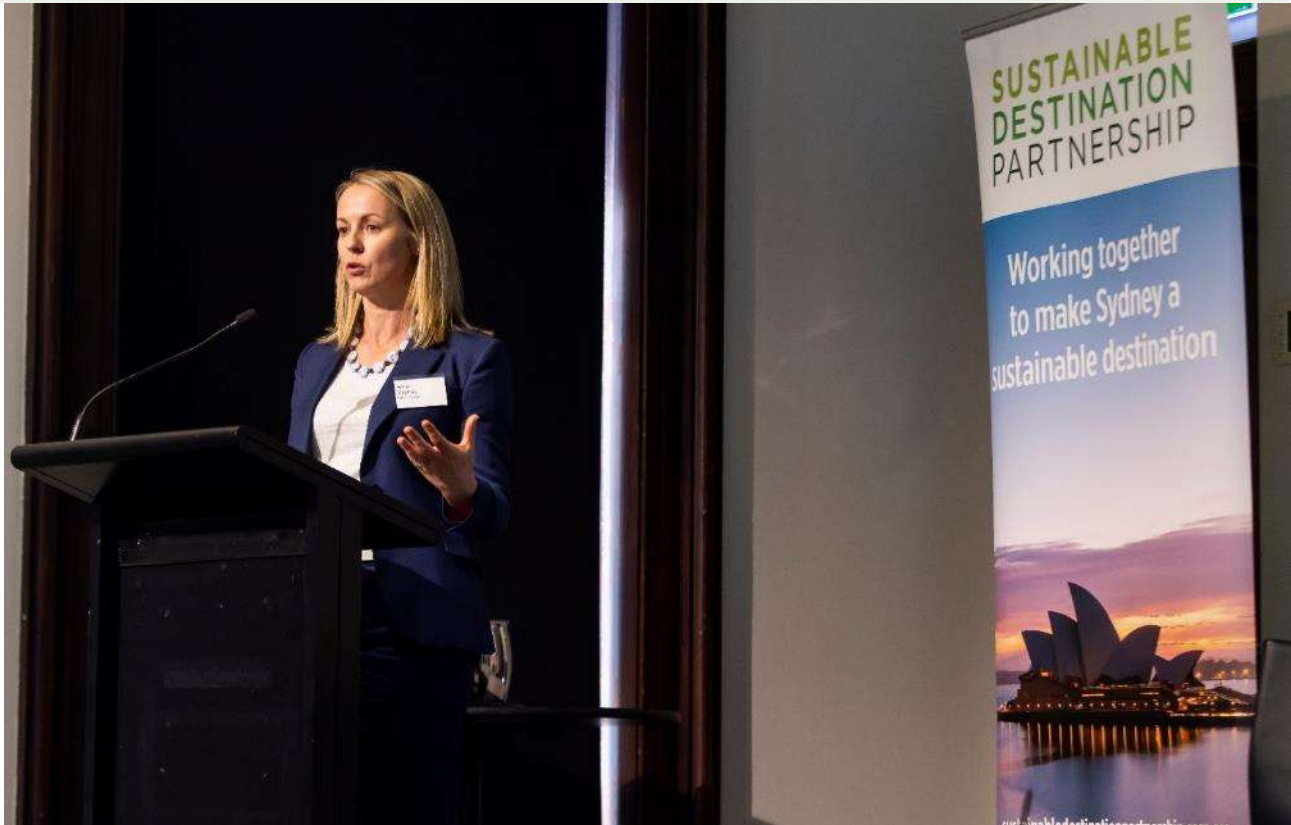
Image: Sustainable Destination event at the Barnet Long Room, Customs House

During the pandemic, the partnership members continued to improve their sustainability performance through improving energy and water-efficiency, minimising waste, and increasing sustainable procurement. These measures will provide strong long-term economic benefits through cost saving as well as attracting more eco-conscious tourists to our city.