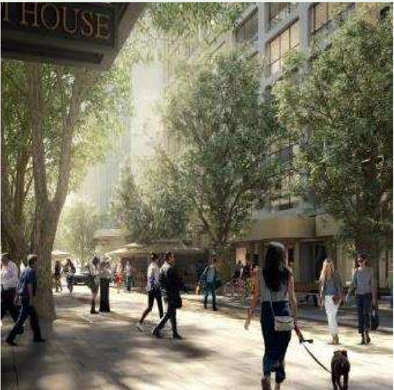
Image: Pitt Street. transformation artist's impression

We are working with Transport for NSW to prioritise people over cars, and the widening of Pitt Street between Hay Street and Eddy Avenue.