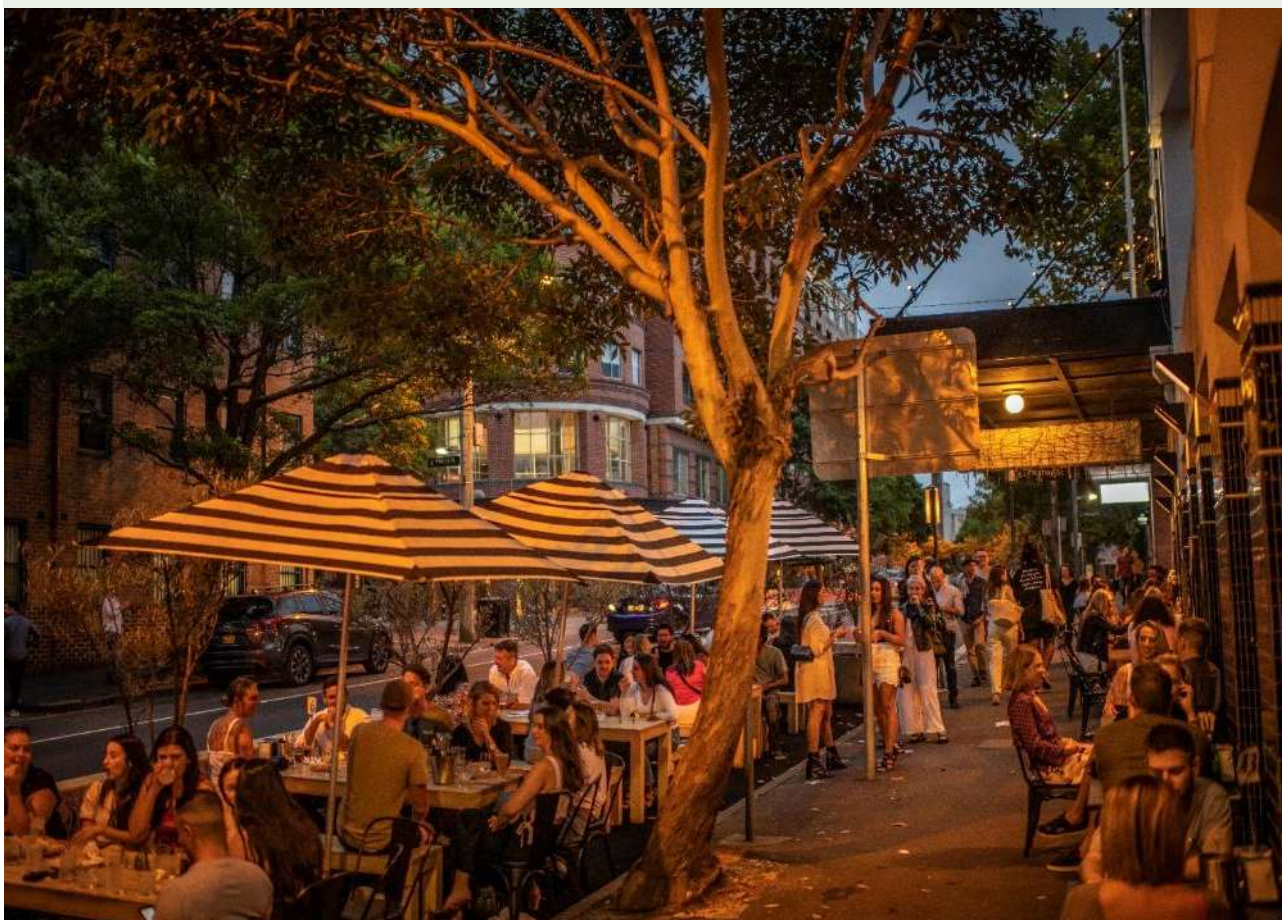
Image: Outdoor dining at the Dolphin Hotel, Surry Hills

Hospitality businesses who have taken up this opportunity have enjoyed growth of customers, turnover, staffing and outdoor dining space, which has benefited their businesses, the economy, and the vibrancy of the local area.