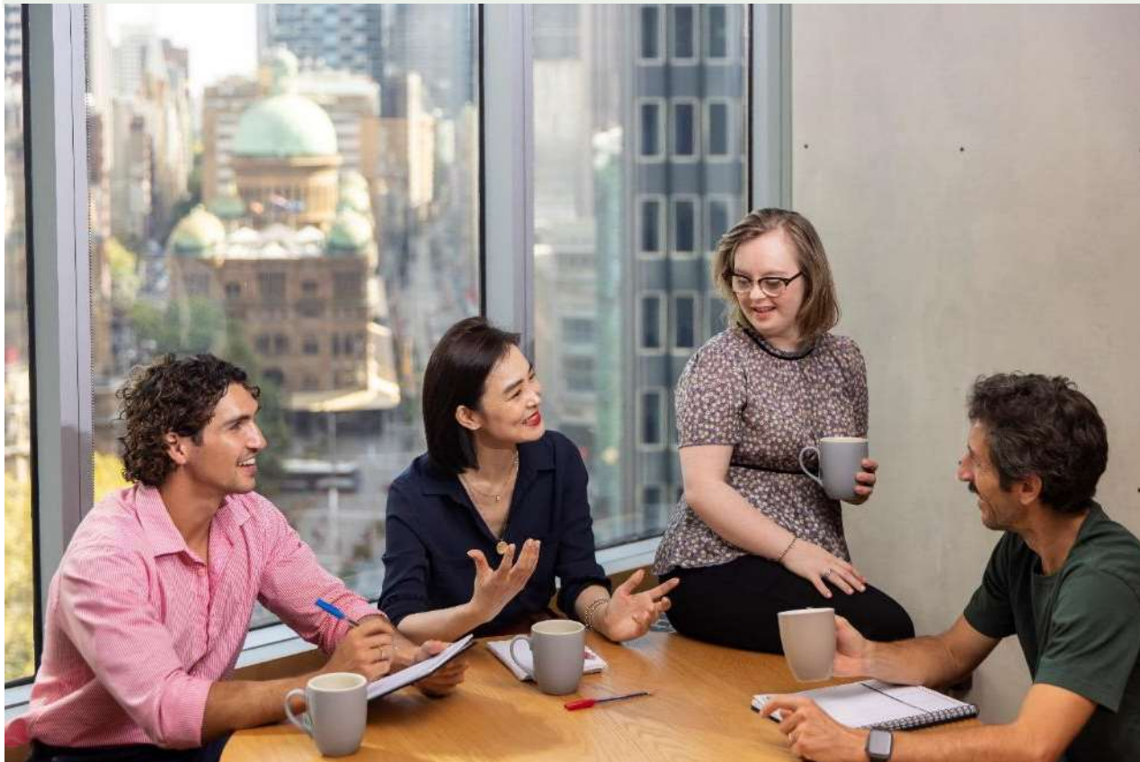
Image: City of Sydney staff enjoying workplace collaboration

Following our involvement in the network, we were awarded Disability Confident Recruiter status. This involved a comprehensive assessment of our recruitment systems and commitment to remove unintended barriers for candidates with a disability. Additionally, we implemented a version of the Australian Public Service's Recruitability scheme. Now, applicants who identify as living with disability, and meet the requirements of a position, will automatically go through to the interview stage. We continue mandatory Disability Awareness training for all.