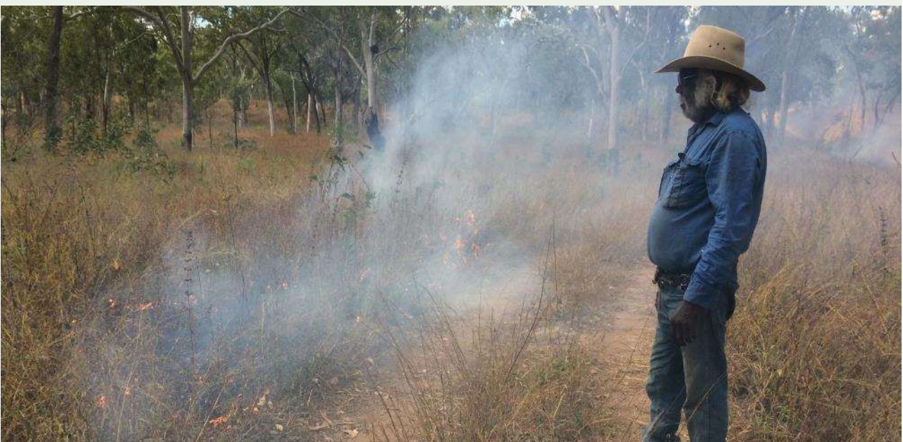
Image: An Elder from Western Yalanji supervising a traditional burn in 2020

The Aboriginal Carbon Foundation is now developing a carbon farming demonstration project on Aboriginal land in NSW. This project received funding by the Carbon Neutral Cities Alliance due to its significant potential to reduce emissions and provide economic development in our region.