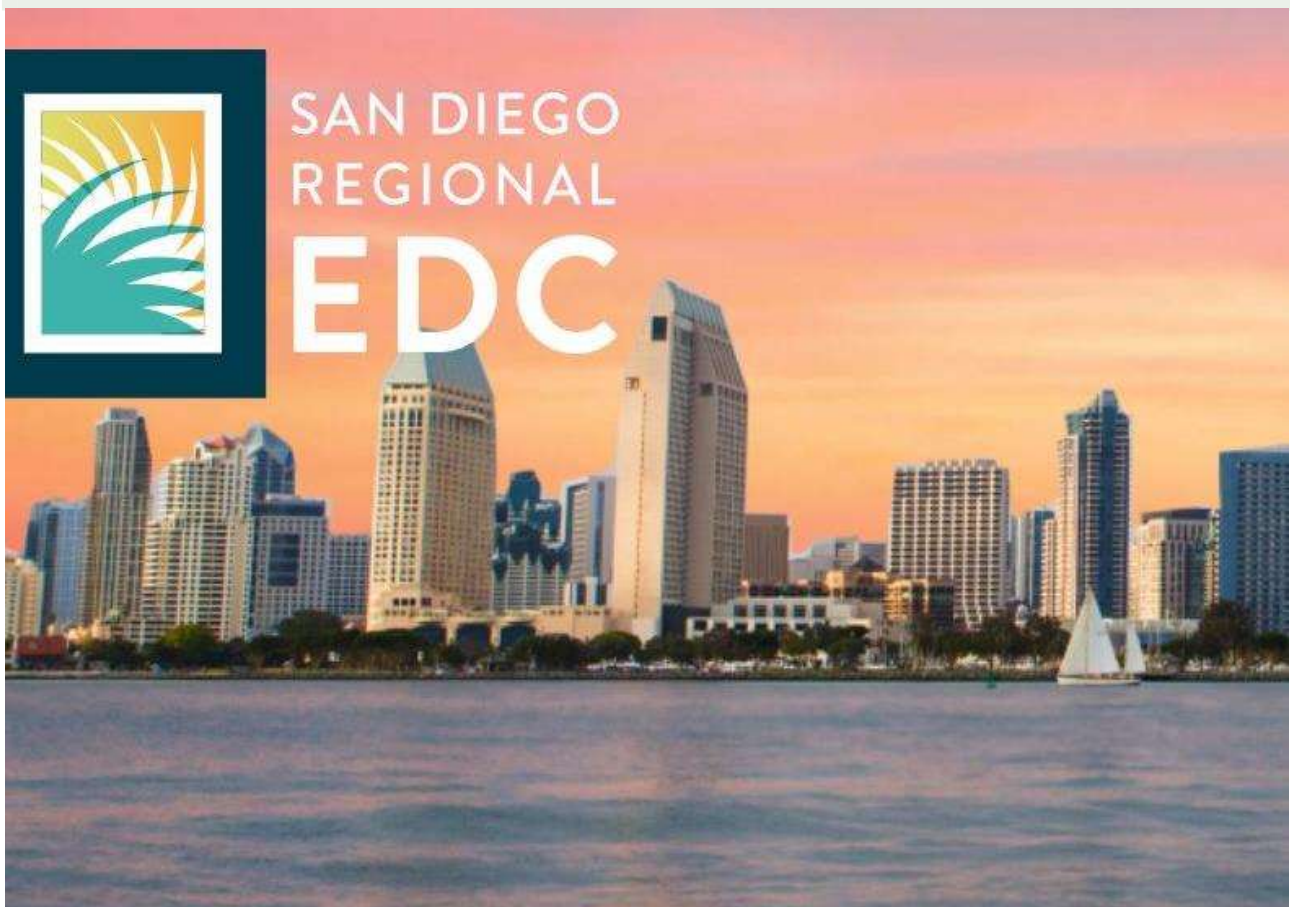
Image: San Diego Regional Economic Development Collaboration, hosting the San Diego anchor institution collaborative