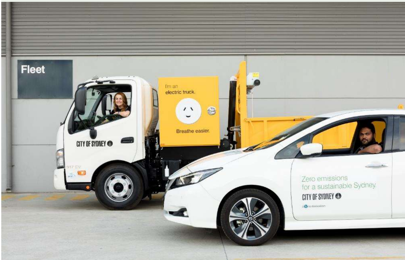
Image: City of Sydney staff with the fleet's first electric truck and car

We're aiming for zero fleet emissions by 2035. Currently we have 19 electric cars, 40 hybrid cars, 70 hybrid trucks and one fully electric truck.