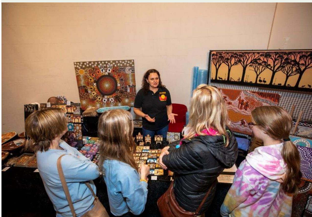
Image: NAIDOC in City 2022, Sydney Town Hall

Community wealth building principles are seen here building the generative economy through supporting social enterprises.